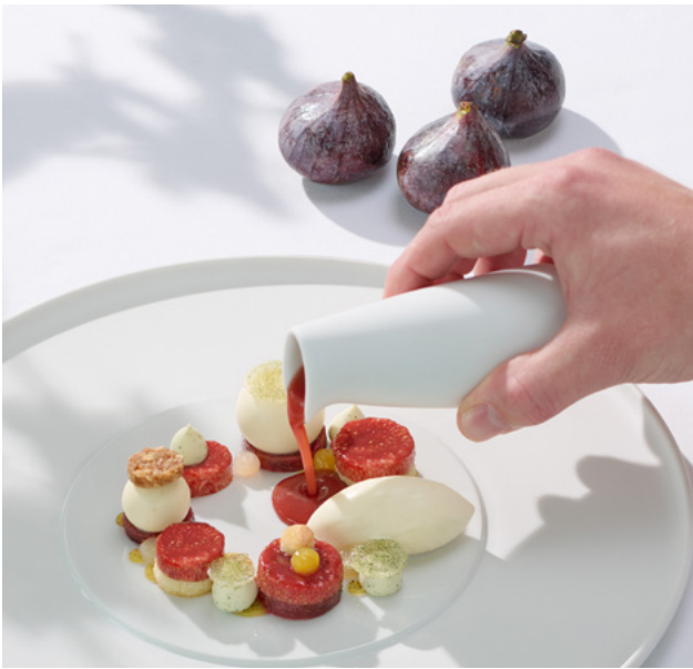
Fig – Almond – Kalamansi

A play of textures and temperatures that elevates the fig in its entirety: raw, glazed, and cooked, accompanied by almond mousse and ice cream.