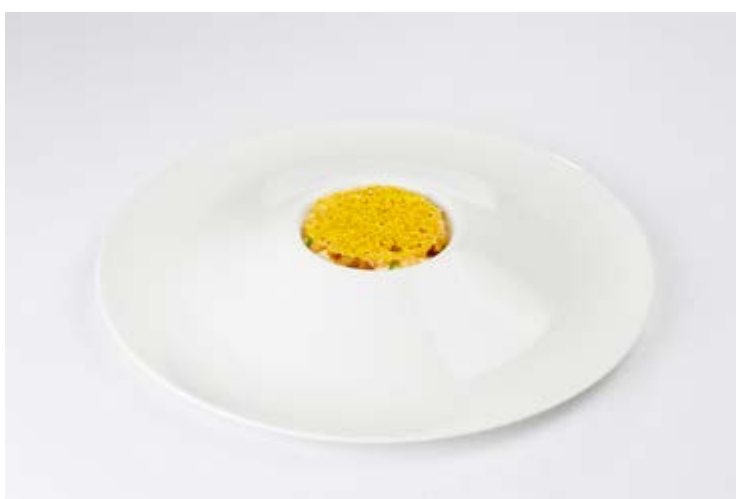
Chickpeas Organic, and grown just a few miles away, accompanied here by coriander and yoghurt with curry spices for a sensual journey rich in textures