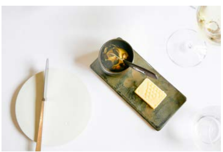
Pumpkin seed Butter Pumpkin seed butter, a nod to the family farm in Austria, to the Kürbiskernöl* of Styria, a region known as the «green heart of Austria».