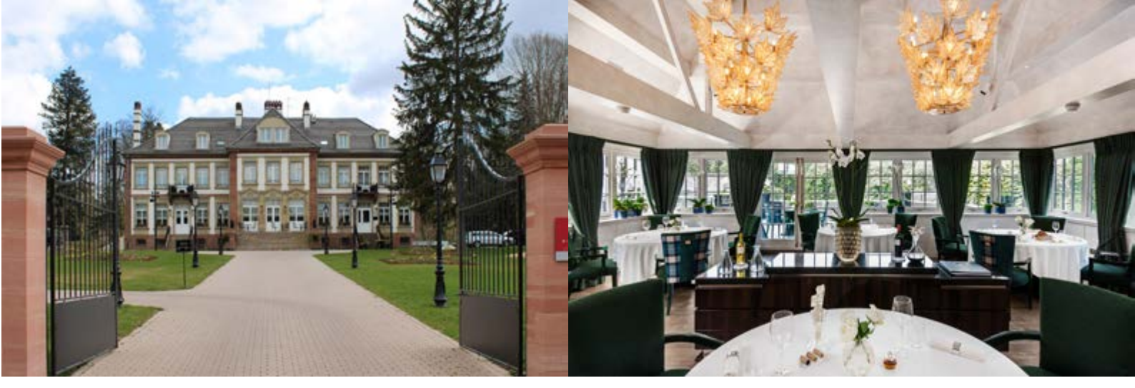
Château Hochberg by Lalique – Wingen-sur-Moder, Alsace