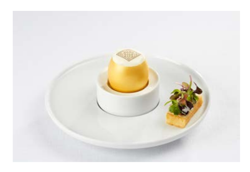
Egg à la Florentine The perfect egg, cooked at 62°C for two hours, served in its shell with some wilted Alsace spinach and a parmesan cream in an elegant comfort-food alliance