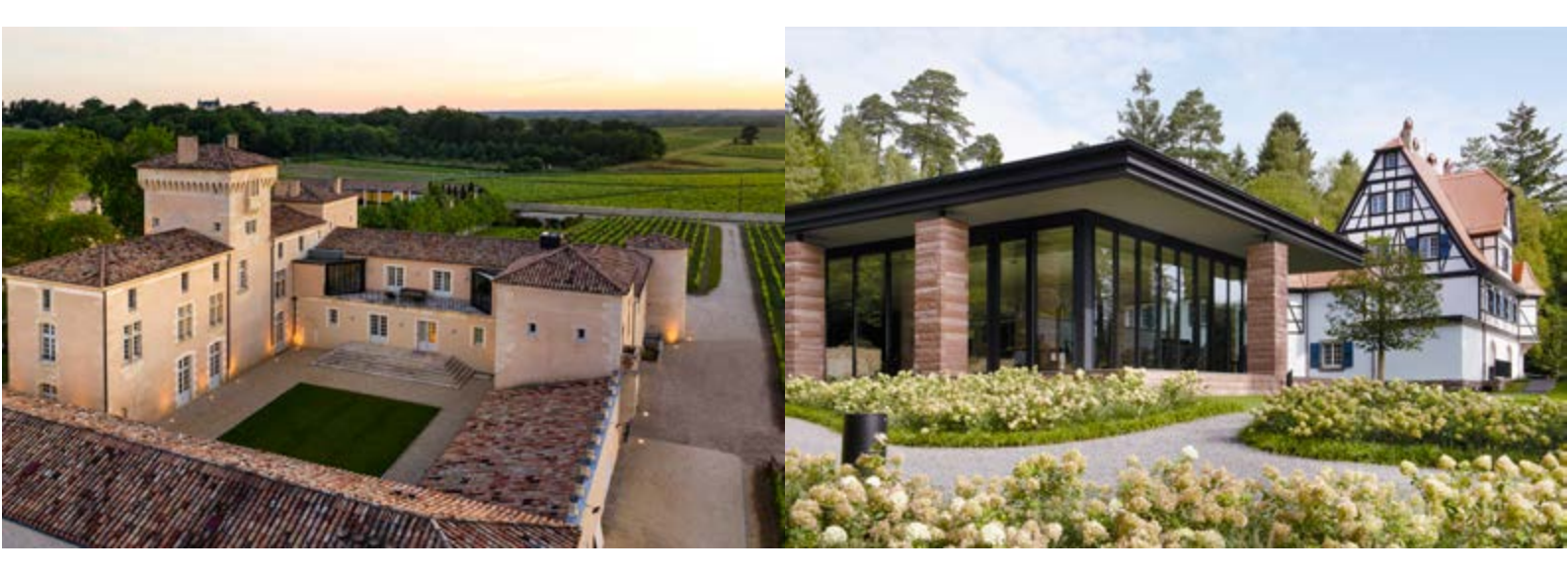
Château Lafaurie-Peyraguey – Bommes, Bordeaux region