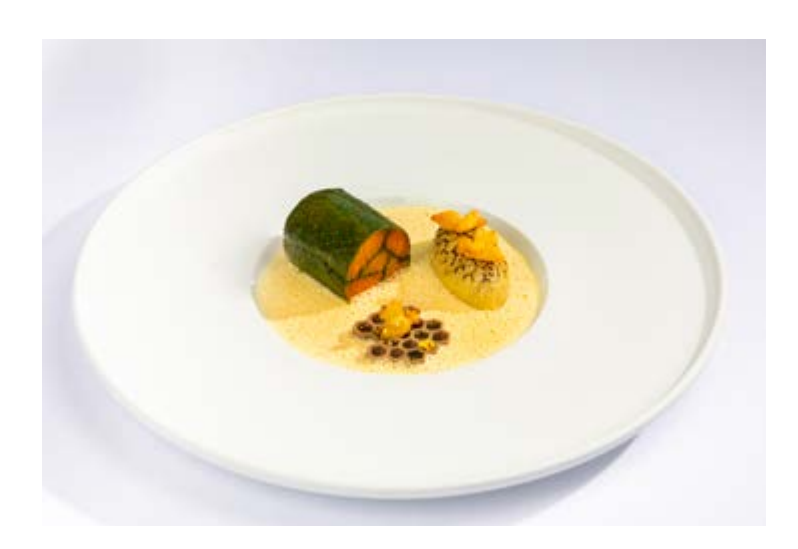
Salmon trout from Sparsbach A local treasure accompanied by an alsacian saffron and propolis velouté, stuffed buewespaetzle and mushrooms